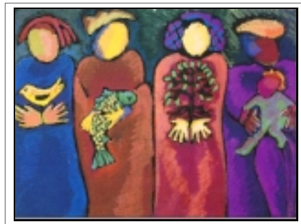
ANDVSA Legal Advocacy Project